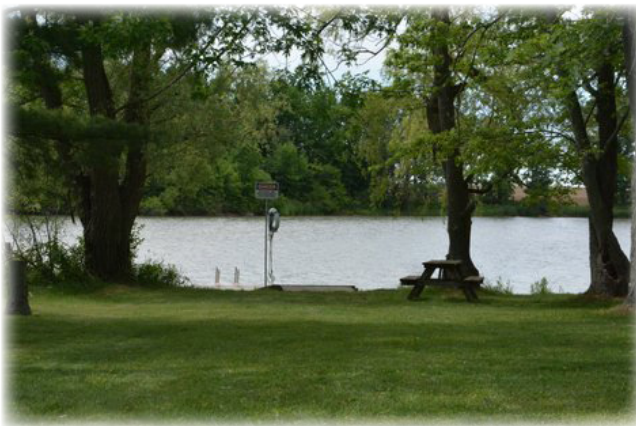
View of lake Niapenco from the Germania Park