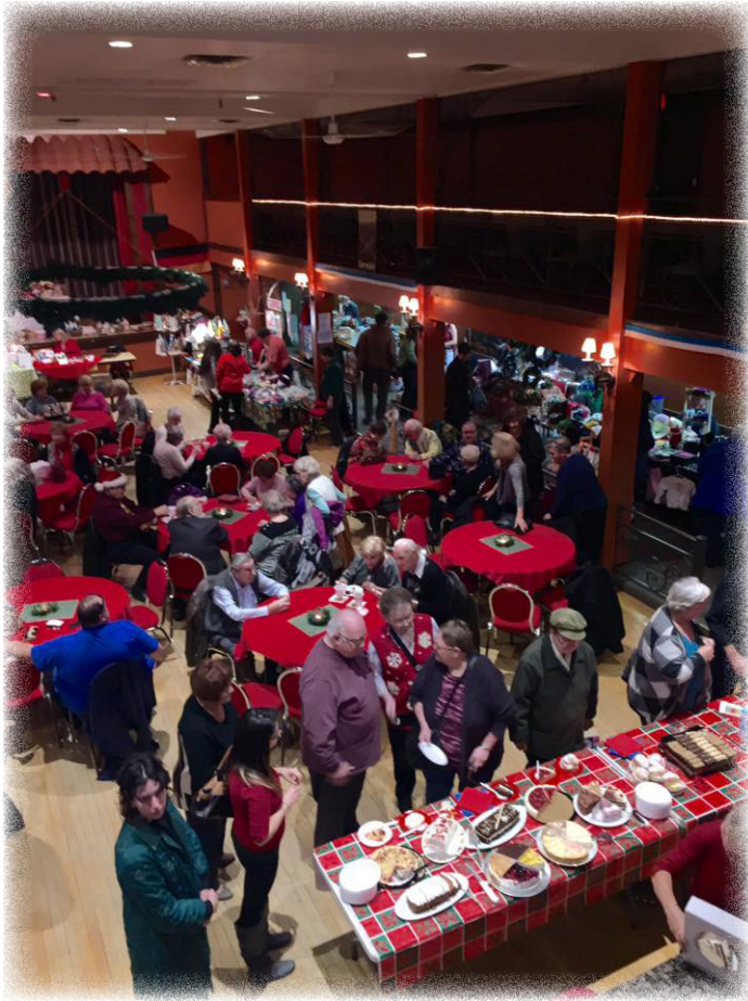
From the archives; Photo of a busy Ladies Auxiliary Christmas Bazaar. Cake and Coffee, great shopping, and gemütlichkeit. See you all NEXT year at the annual popular event.